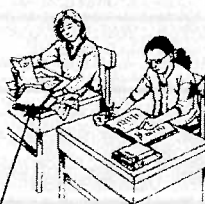
desorganizado(a) ( unorganized )