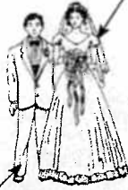
bajo(a) ( short )