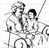
viejo(a) ( old )