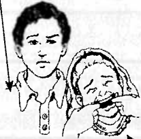
cómico(a) ( funny )