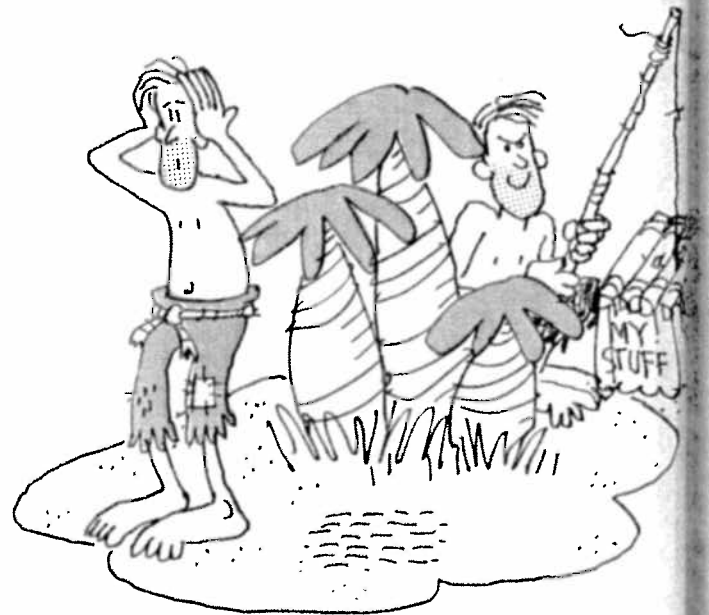
Why did Locke believe it was necessary for people to create governments?