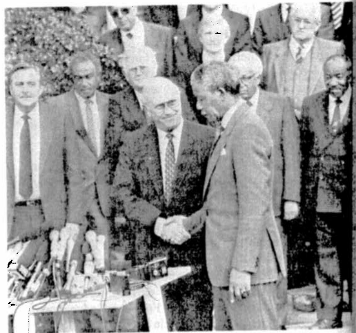
Did the end of white rule in South Africa in 1993 result in a state of nature? Why?