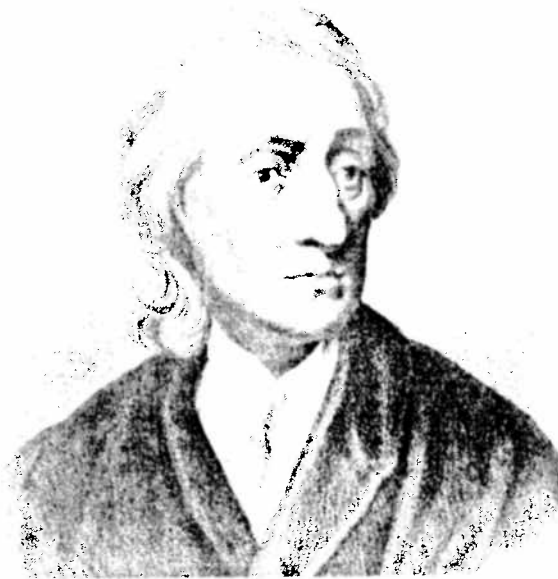
John Locke (1632–1704)

In what ways did Locke's ideas influence the Founders?