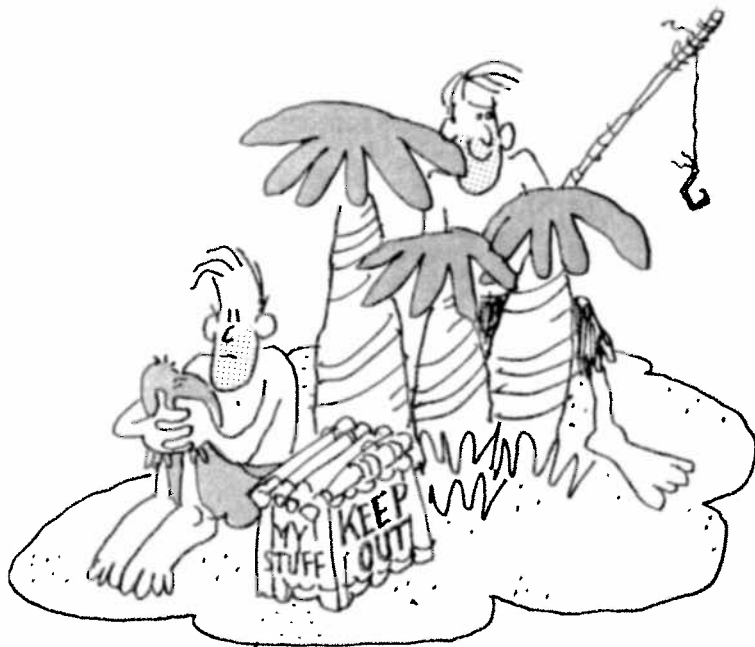
According to Locke, how is personal property protected in a state of nature?

Locke believed that most people understood this law of nature through the use of their reason and followed it because their consciences obliged them to do so. Not all humans were reasonable or good, however. There might even be disagreement about what the “laws of nature” were. If there were no government, there would be no one with the right to interpret or enforce these laws.