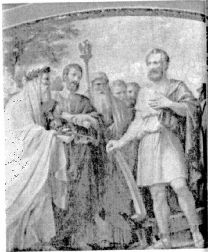
Is civic virtue as important in America today as it was in ancient Rome? Why? Why not?

of civic virtue whom Americans should emulate. His fellow Americans admired George Washington as a modern-day Cincinnatus because he sacrificed his private pursuits in order to lead the nation in war and peace. George Washington was often called "our Cincinnatus" because his fellow citizens believed he was an example of the civic virtue that all citizens should possess.