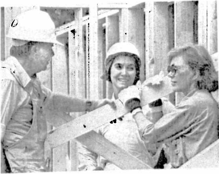
President Jimmy Carter and wife Rosalynn join 100 volunteers to construct low income housing.

Do all Americans have an obligation to practice civic virtue? Why?