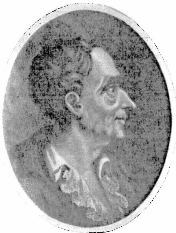
Baron de Montesquieu (1689–1755) What important contribution did Montesquieu make to the Founders' ideas about government?

He admired the Roman Republic as a representative government that combined elements of three basic types