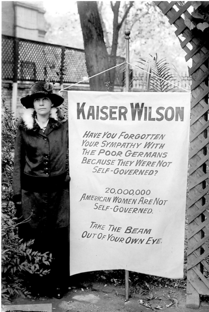
Still Pictures Branch, National Archives at College Park.

Source: National Archives, Photograph, 1918.