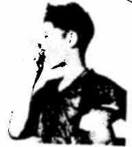
▲ Many people with asthma carry inhalers containing bronchodilators. These medicines ease breathing. How does keeping their environment clean help people with asthma breathe easier?